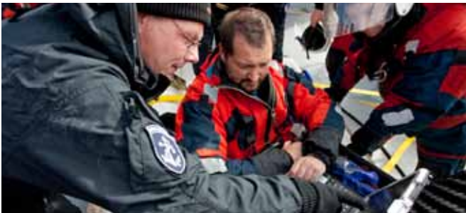
Reviewing data within minutes of vehicle recovery.