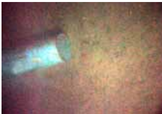
Left: Side scan image of a mine like object captured at 900 kHz.