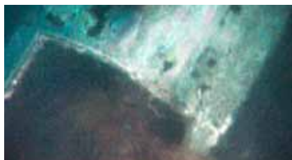
Detail of bottom hatch from the Gavia camera system.